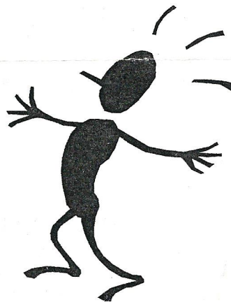
Too Little Time

I still find each day too short for all the thoughts I want to think, all the walks I want to take, all the books I want to read, and all the friends I want to see. The longer I live the more my mind dwells upon the beauty and the wonder of the world.