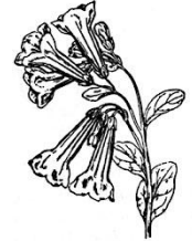
869. M. virginica .

There will be a "Workday" on Sat. May 24 beginning at 8:30 a.m. We will be planting, mulching, & eliminating invasive plants. Bring gloves and tools and join the fun.