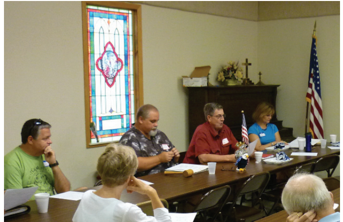
Photo from Annual Meeting, July 2012

The SRPOA board was very gratified by the large turnout for the meeting and the warm reception by the property owners in attendance. It is a pleasure to serve when your efforts meet with acceptance and approval. Thank you.