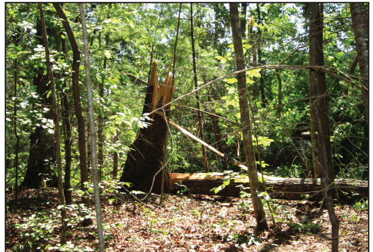
Huge tree snapped off in Saddle Ridge

Word has it that AT&T will be out within the next couple of weeks to get those final lines replaced and repaired. Some say they won't believe it till they see it! 🌩️