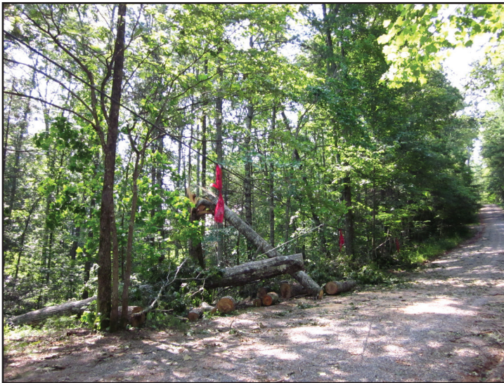
Phone and power lines down on Grouse Top