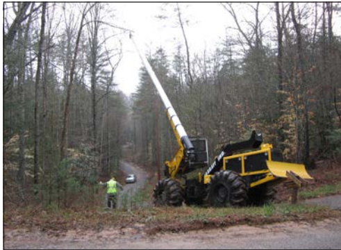
ABC Tree Service, contracted by Alcoa Electric, trimmed trees and limbs from power line areas in April.

As you are aware, we have several local activities taking place that will benefit Saddle Ridge directly. Alcoa Electric has had tree crews in and around Saddle Ridge for several months now. Their efforts seem to have lessened the number and duration of power outages.