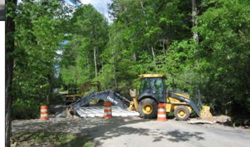
Above: Picture of the new bridge on East Miller's Cove Road. Right: Construction of the bridge taken on May 11. Residents had to use Loop Road as detour.