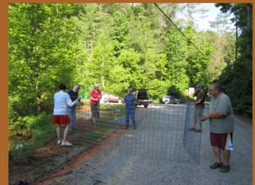
The group begins to assemble the sides.