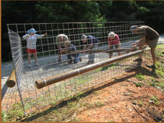
Floats are affixed to the sides and floor.