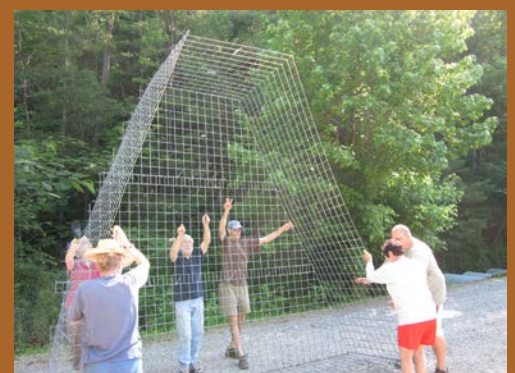
Cage is flipped.