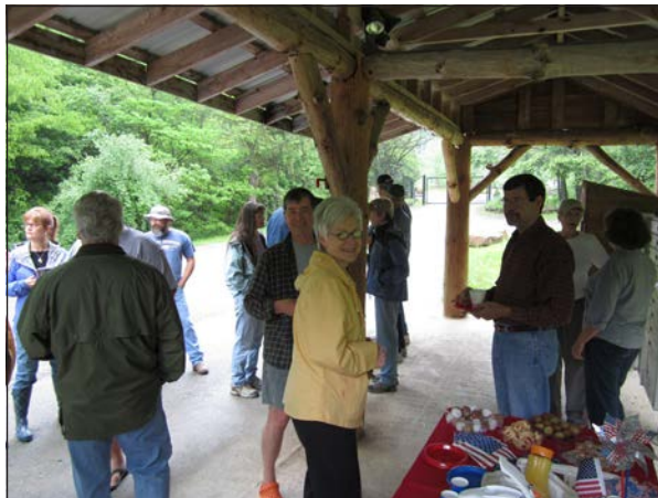
Many residents braved the rainy weather to enjoy some refreshment prior to the Flag Raising Dedication.