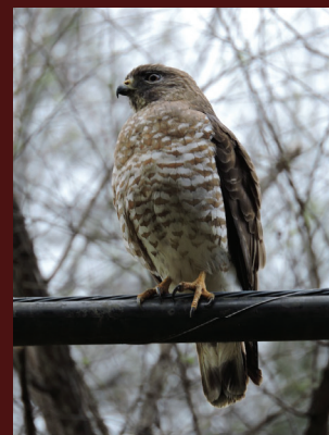
Broad-winged hawk spotted at the pond, April, 2016.